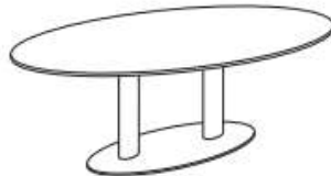
Buddha ellipse table metal tube legs dia 16