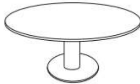
Buddha round table metal tube leg dia 16/22

Buddha round table metal tube leg dia 16 or 22